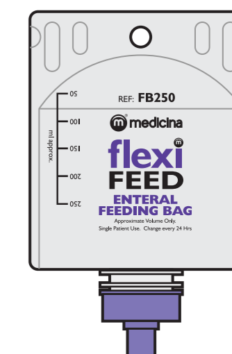
FB250 250ml Enteral Feeding Bag