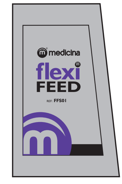
FFS01 Enteral Feeding Bag Stand